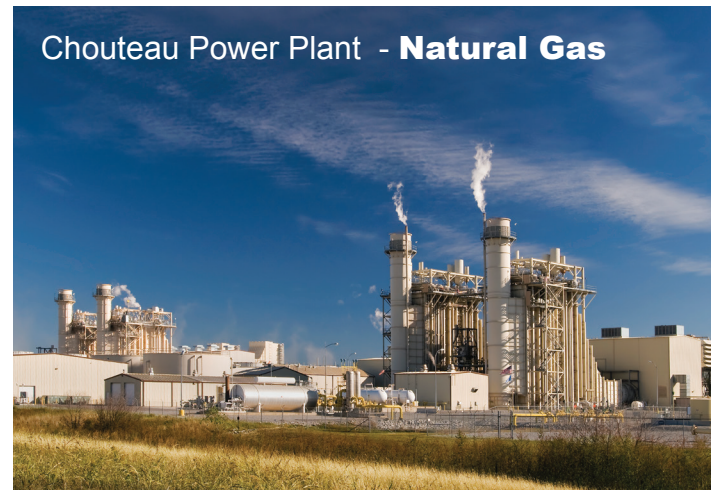
Chouteau Power Plant - Natural Gas

Wind and hydropower also are important parts of Associated's generation mix. They only produce electricity when wind and water are plentiful enough to make turbines spin. Generation from renewable sources, like solar, typically don't match members' peak use times — early in the morning on a winter day or late in the day during the summertime. This mismatch is why having a diverse power supply, with a foundation of around-the-clock resources like coal and gas, is important.