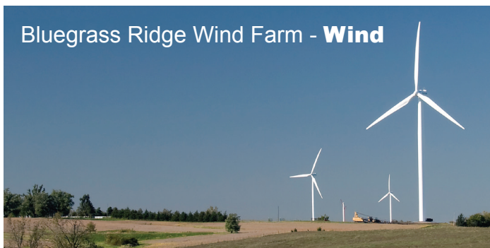
Bluegrass Ridge Wind Farm - Wind