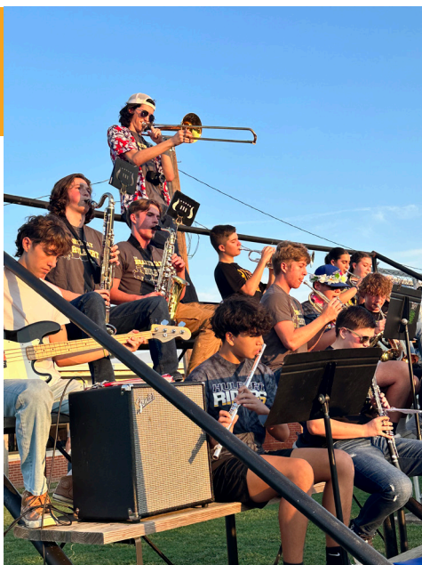
Hulbert band playing fight song and cheering on team.

The Hulbert Rider High School marching band is $5,000 closer to reaching its goal of purchasing brand-new marching uniforms, a first in the school's history. Hulbert Rider Band has never had its own set of uniforms. The young musicians began by performing in street clothes, then moved on to matching band t-shirts purchased by supportive parents.