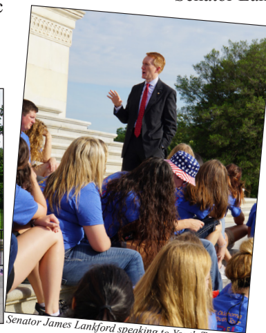
Senator James Lankford speaking to Youth Tour