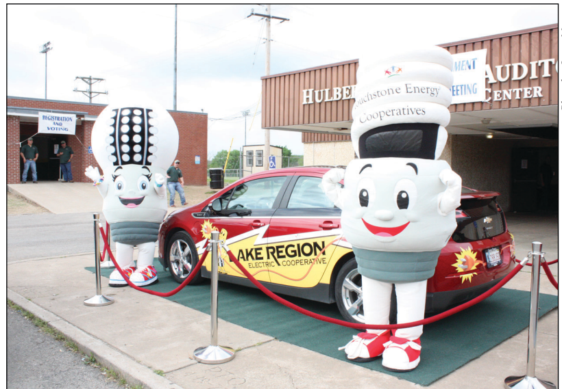
LED LUCY AND CFL CHARLIE POSE FOR A PHOTO AT ANNUAL MEETING WITH LREC'S ELECTRIC CAR

No votes. The profit from the telecommunication subsidiary will be returned to LREC. With a subsidiary, the cost of the telecommunication services will not, effect the electric cooperatives rates. LREC will continue to be a non-