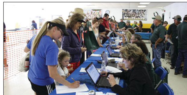
LREC Members signing up to vote at the annual meeting.

LREC would like to thank all the members who attended this year’s annual meeting and we hope to see everyone next year.