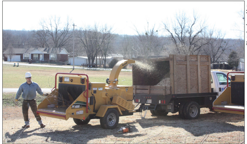
Mark Squyres, LREC Right-of-way employee

The new chippers also have a smart feed system which helps increase productivity while reducing strain on engine parts. The feed sensing control monitors engine rpm and auto-