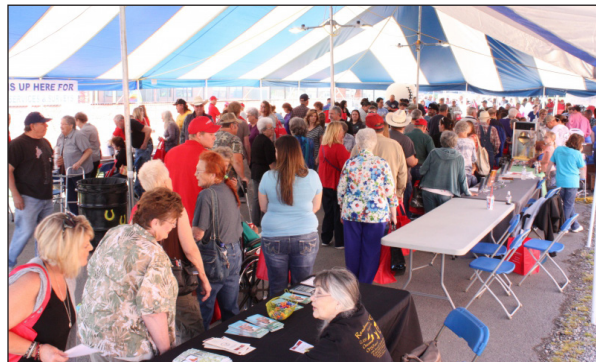
2016 Annual Meeting

LREC's annual meeting is designed to take care of the important business of your co-op and the equally important business of building a real sense of community. All cooperatives serve both